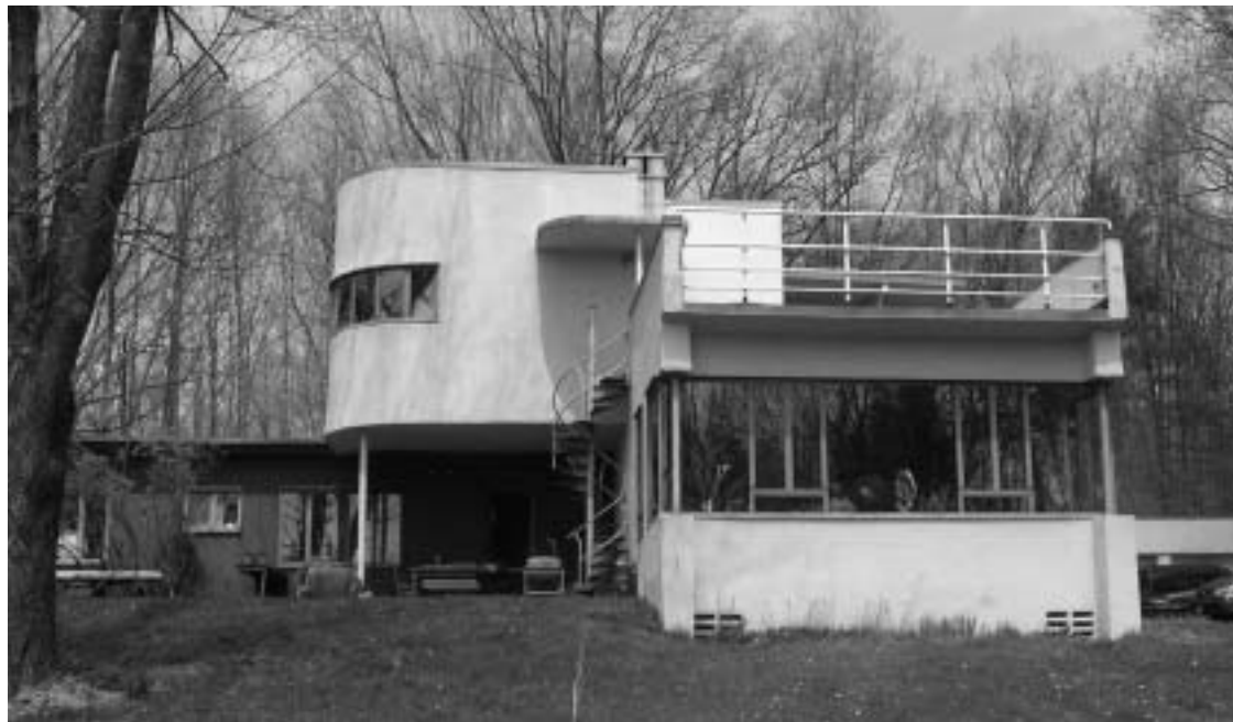
Field House, New Hartford, CT