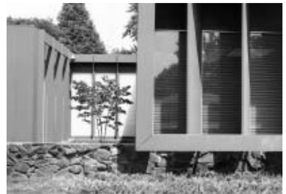
Detail: corrugated 16-in steel panels

Structurally, the Behlen house was overbuilt, almost as if it had been constructed for industrial purposes—or an engineer's dream. The house utilizes over sixteen miles of single-conductor wire and three-phase 220 circuits, the same as was used on the battleship Missouri . The house was built on a concrete slab, with only 1/4" inch variance from end to end. Fluorescent lights were used throughout the