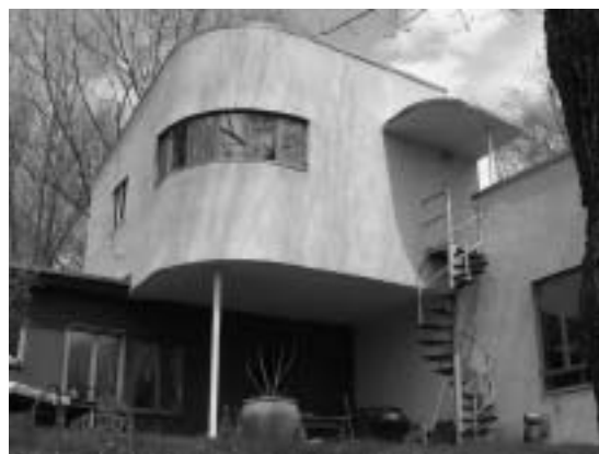
Detail, Field House, New Hartford, CT