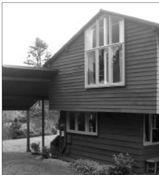
Exterior, Joss House, Portland, OR

For Oregon's preservationists, the sellout success of the recent Street of Eames tour in April, 2006, is a hopeful sign for the survival of mid-century modern houses. 600 people joined the tour and its affiliated events, demonstrating the growing appreciation for this important architectural legacy. The visit to six houses provided a unique opportunity to see quintessential examples of many modern styles and to follow their evolution from 1942 until today. Several were in the Northwest Style, a regional reaction to European modernism that emphasized detailed wood structures and connections to the area's unique light and landscapes.