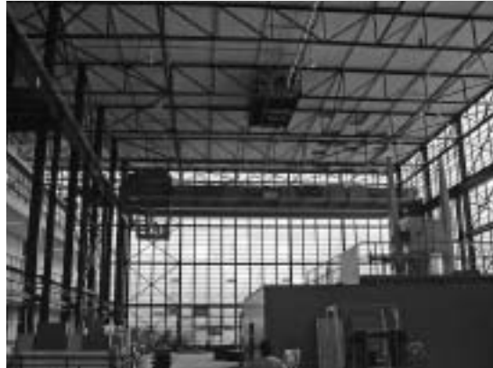
Gunner's Mates School, Great Lakes Naval Station, IL