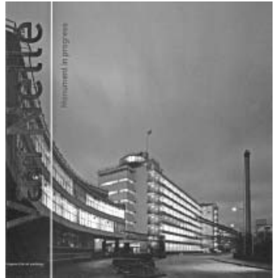
Van Nelle: Monument in Progress