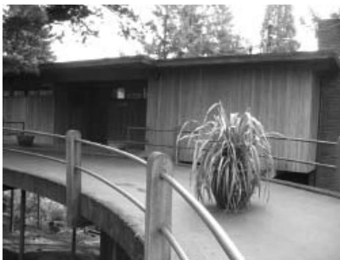
Dixon House, Portland, OR