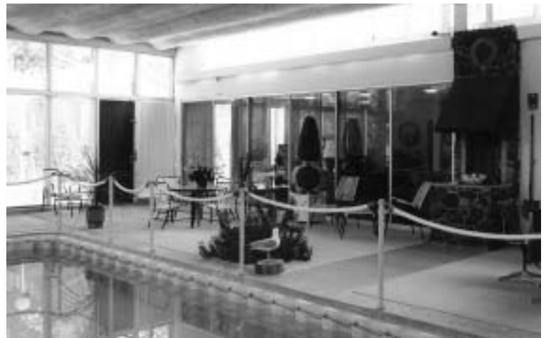
Natatorium, with steel paneled ceiling

Editor's Note: Control of the home was recently returned to the Behlen family after the state Attorney General ruled that the title had not been properly transferred from the family to the Nebraska State Historical Society (NSHS). Furthermore, Nebraska state officials declined to approve acceptance of the home for use as a state-operated historic site, despite its listing on