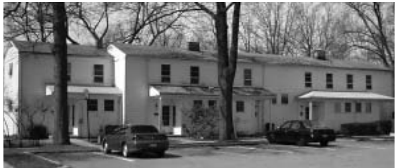
Rowhouses in Greenhills, OH

The Greenhills Historical Society has, with the backing of the Cincinnati Preservation Association and the National New Deal Preservation Association, requested a moratorium on demolition in the village, and asked for an open planning process to guide future development. However, some townspeople welcome the redevelopment,