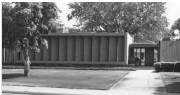
Behlen House, Columbus, NE, 1958