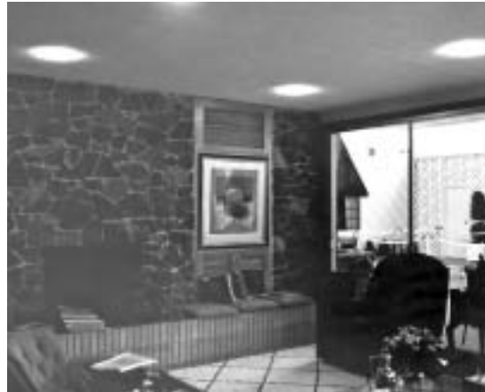
Family room with natatorium visible through glass doors at right