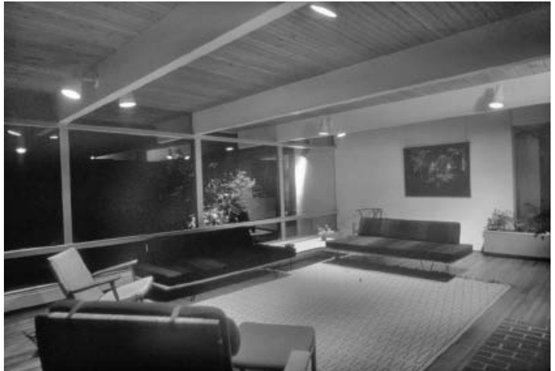
Interior, Kuhn House, Princeton, NJ, 1960-61

If you would like more information about how to prepare a fiche, get a copy of the NY/Tri-State "Wish List," or to sign up to document a particular building contact, the Register Committee Chair via nytri@docomomo-us.org .