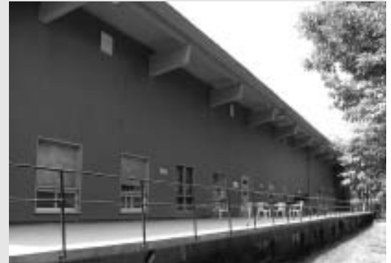
Hostess House, Great Lakes Naval Station, IL

The Great Lakes Naval Station project in Great Lakes, Illinois, was the first military project of Skidmore, Owings, and Merrill (SOM). The Hostess House (Building 42) was designed by Gordon Bunshaft and completed around 1942. It remains the only extant building designed by Bunshaft from the pre-war years. This building is an exceptional testament to the development of both the firm and modern American architecture. The rectangular building sits on a long narrow site, encompassing diverse programs including a reading and writing room, reception room, lounge, terrace, and offices. The roof consists of a series of laminated wood frames, which are supported at both ends by steel columns. The exposed wood trusses project through both façades, uniting inside and outside, creating a dynamic atmosphere.